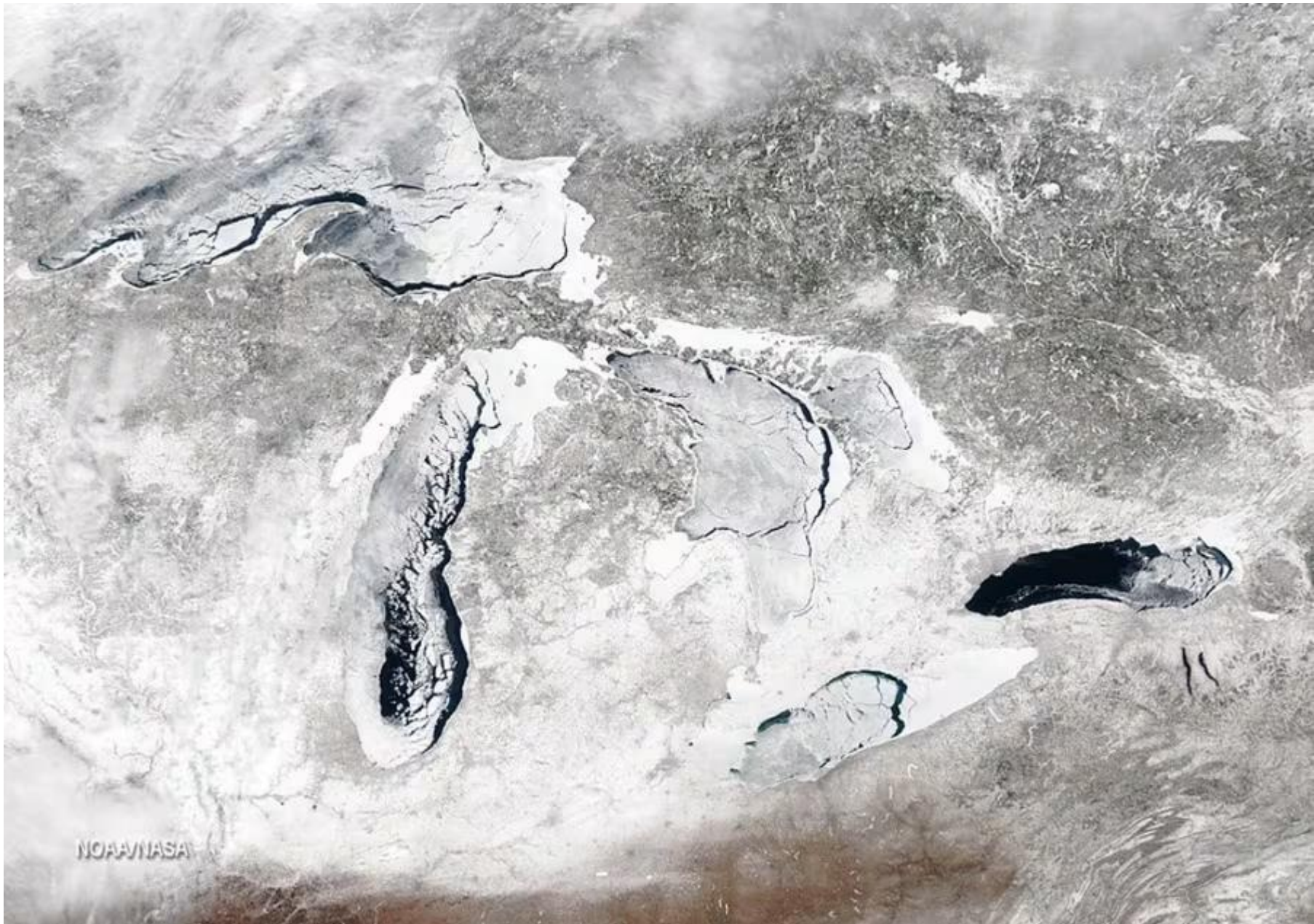
Image of ice coverage back in March 2014. Back then, ice coverage was at about 92%.