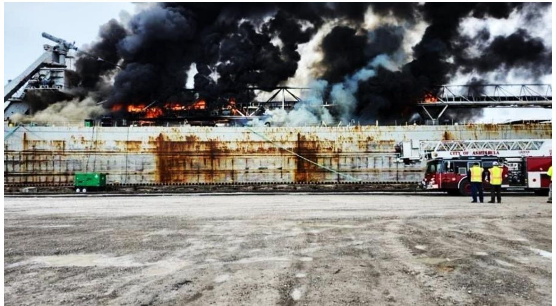
Cuyahoga Fire 3-15-2024