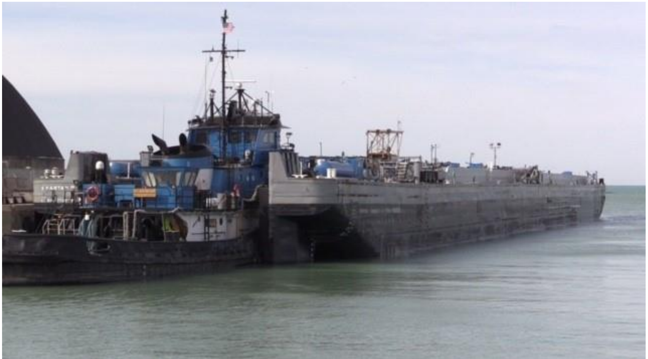
'Spartan,' a ship that carries liquid salt, was the first ship into Goderich, Ont.'s port for the 2024 shipping season on March 25, 2024.