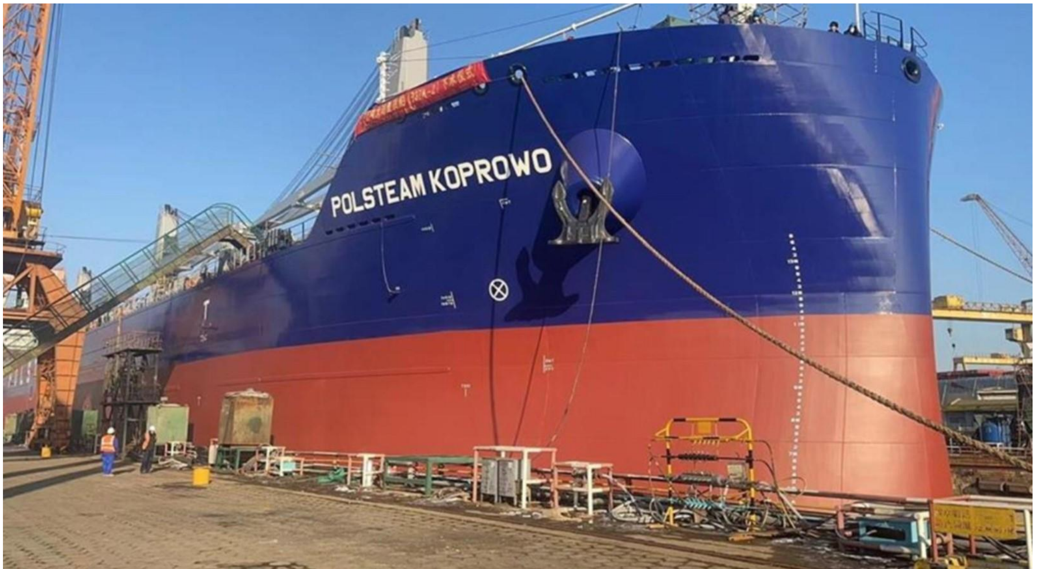
PZM Takes Delivery of 37,000 DWT Great Lakes Bulk Carriers Polsteam Dabie www.imarinenews.com