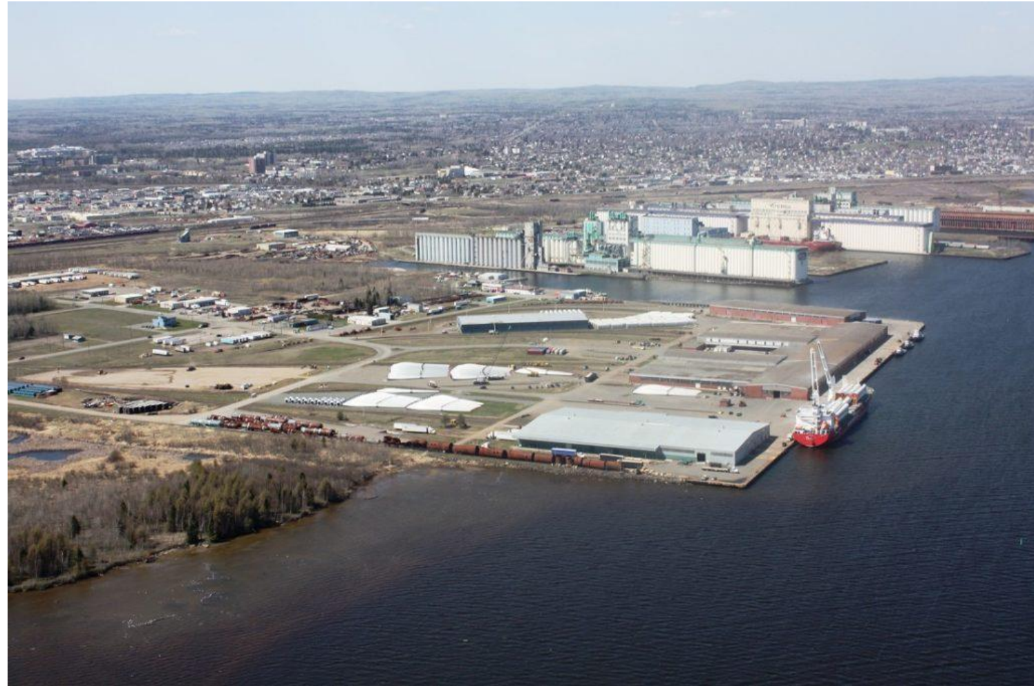
Port Directory – Port of Thunder Bay