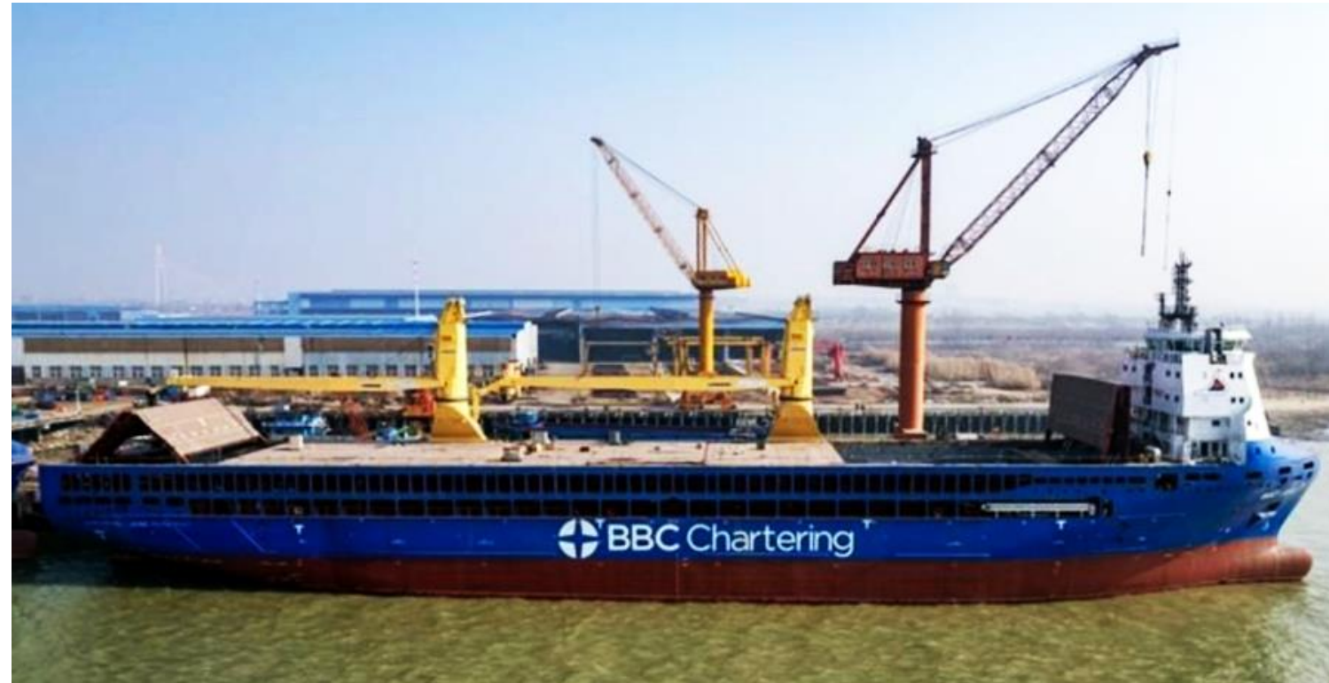
BBC Leer 1st of a series of new LakerMax Vessels

The company will take delivery of 10 LakerMax, 13,000 dwt MPPs starting this April until 2026.